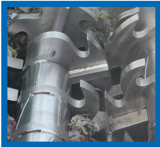
Patented open cutting table

With processing rates from 1 to 150 tons per hour, SSI's PRI-MAX product lines represent the most comprehensive range of multi-material reducers in the world.