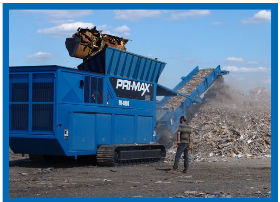
PR-4000 on tracks

• Heavy duty, open-grate cutting table and strategic cutter placement ensure that abrasives including aggregate, sand, soils and metal fragments will fall directly through the cutting table, reducing wear and operating costs.