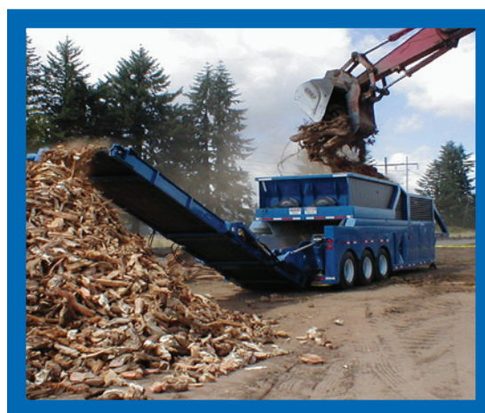
PR-4000 mobile reducer processing stumps

• Advanced Programmable Logic Controller (PLC) constantly supervises and monitors the systems and functions of the entire machine including temperature, error reporting, reversing of shafts under severe load and alarms for non-shreddable material.