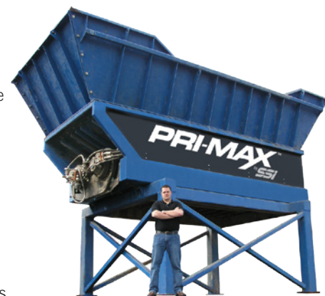
Model PR-6000S, primary reducer

• Operational modes are easily programmed to suit materials being shredded.