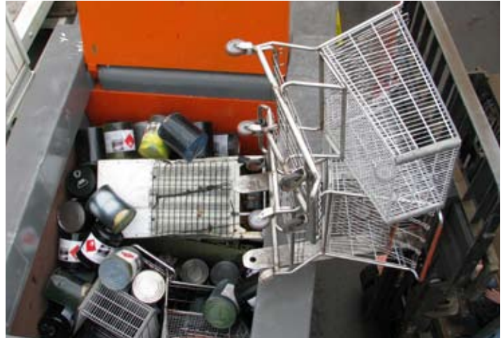
Fast and efficient single-cylinder operation

SSI's Crusher is built for rapid loading and compaction of bulky materials, consistently delivering bales at ideal density for auto shredders.