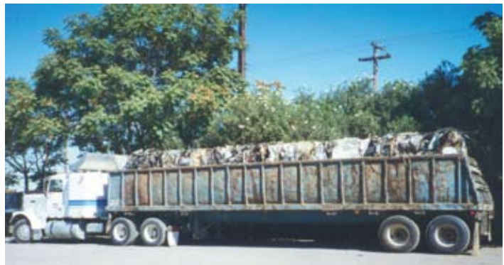
A 40,000 lb. single trailer payload