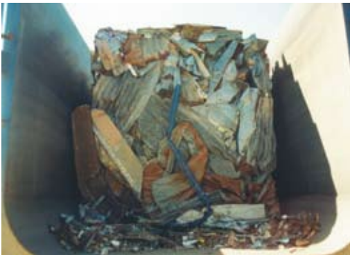
Close-up of compacted bale